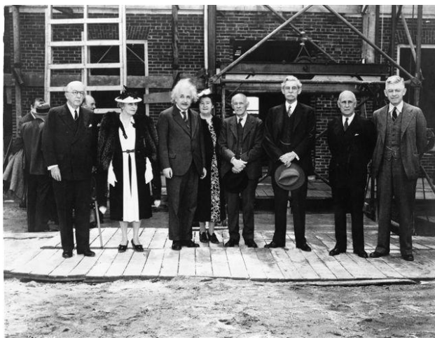
Albert Einstein takes center stage for this photograph taken on May 22, 1939 at the dedication ceremony for the Institute's first building from Images of America: Institute for Advanced Study , Arcadia, 2011.